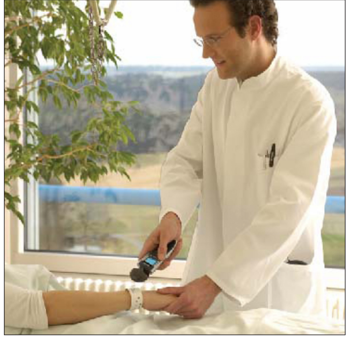
Figure 1. Use of an RFID reader to identify a patient. The RFID tag is on the wristband of the patient.

An RFID system contains two components: a reader and a tag. A reader sends out a radiofrequency (RF) pulse that triggers a response from a tag in the vicinity that is part of its network. The reader then reads the response to determine which unique tag is in the vicinity. An RFID tag is a small device that can be attached to a piece of equipment, a worker's identification badge, or a patient's identification bracelet ( Figure 1 ). RFID tags contain antennas that allow them to receive and respond to RF queries from an RFID reader. They transmit data back to the reader using RF. There are two types of