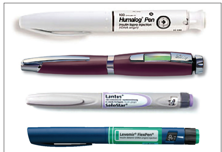
Figure 2. Pen devices used for injecting insulin.

can do for them is to make their lives easier. Discussing and prescribing pen delivery devices to use for insulin injection are major help we can provide.